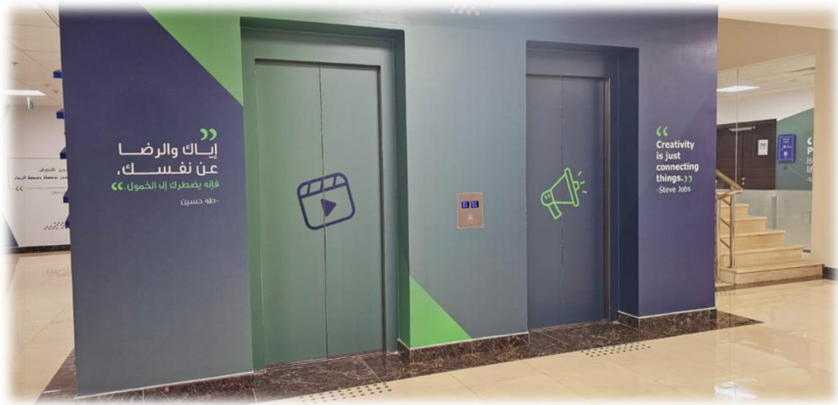
Elevators and stairways with tactile indicator guide