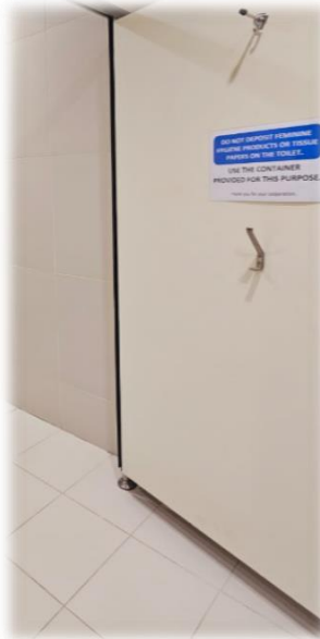
Emergency Call System