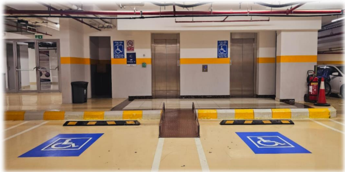
Parking space Ramp Elevator